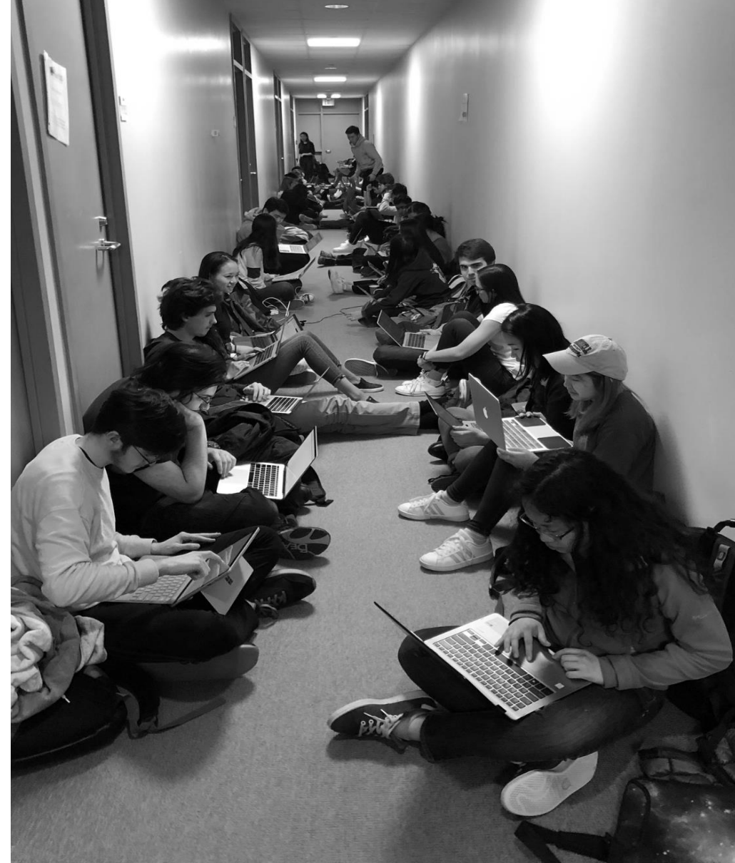
Cornell University programming students wait for 2 hours to seek clarifications 1